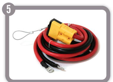
6 ft. Battery Lead